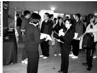
PICK ME: Students line up to speak with Intel recruiters at the EECS Internship Fair.

At the EECS Internship Fair on January 22, students crowded around tech company recruiters to distribute their resumes, and Pauley Ballroom buzzed with nervous energy. It appeared to be