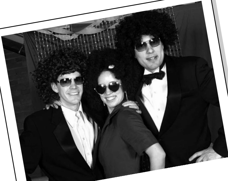
FACIA AND PHOTO