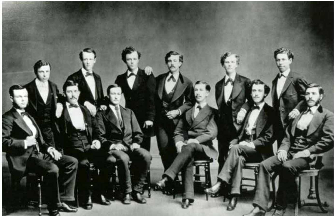
1873 The University of California's first graduating class included two engineers, as well as a future governor, mayor, math professor, minister and three future regents of the university. When the university was founded, three of its six colleges were devoted to engineering—civil, mechanic arts and mining.

Today, we celebrate the accomplishments of this year's graduates, who join an enduring legacy of great achievements and successes in the College of Engineering.